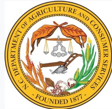
Seal of the North Carolina Department of Agriculture and Consumer Services